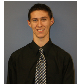
Michael Hyland Gateway Stage