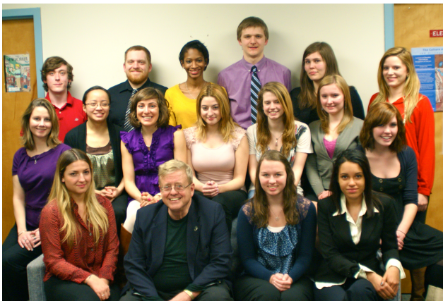
2012 STUDENT & ADVISOR COMMITTEE

In 1975, when the Festival first started, only two students were involved in its organization and management. Today, fifteen students serve as coordinators for the music, food, crafts, and demonstrations that you see today on the field. Alumni of the Festival also serve as advisors to the committee.